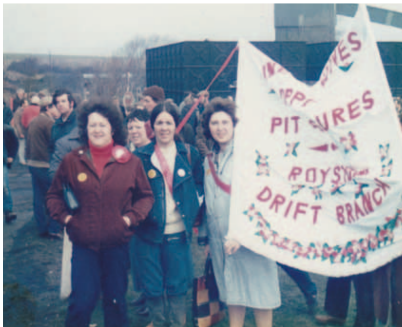
Royston Women Against Pit Closures

A night of strike related music and songs.